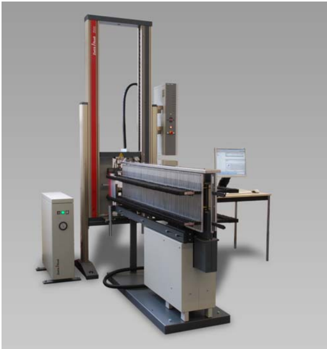
Robotic Testing System 'roboTest F'